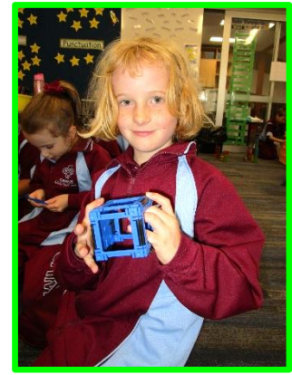
Making 3D shapes with Klikko and using 3D building blocks to build a city.