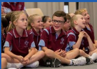
Commencement Celebration more photos inside

Wednesday 21 st March School Board Meeting